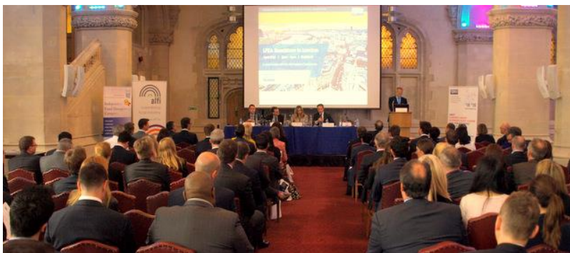
Picture at the LPEA/ALFI Private Equity workshop in London

LPEA recently held two other roadshows in London and Stockholm . The Swedish meeting, hosted by Luxembourg For Finance and headed by the Luxembourg Finance Minister Pierre Gramegna, featured a private equity panel organised by LPEA.