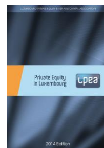
Private Equity in Luxembourg (2014 ed.)