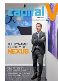
Capital V #5 (Feb. 2015)