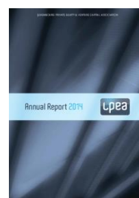
LPEA Annual Report 2014