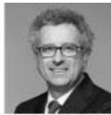
Pierre Gramigna Minister of Finance